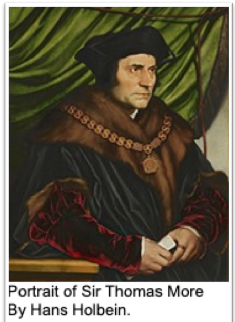
Portrait of Sir Thomas More By Hans Holbein.

"You wouldn't abandon ship in a storm just because you couldn't control the winds."