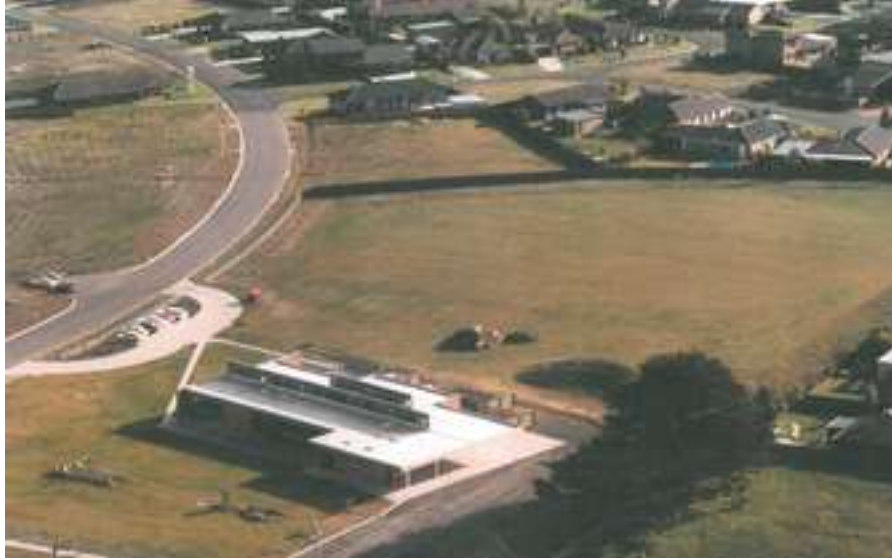
St Thomas More School (1980)

St Thomas More Catholic Primary School is a co-educational parish (St Patrick's Cathedral) primary school situated in Alfredton, within the Ballarat Diocese.